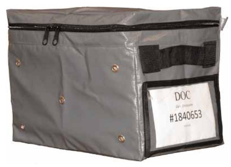
Item: PCSBX103423IMP 10"W x 16 1/4"D x 11"H Available in Gray