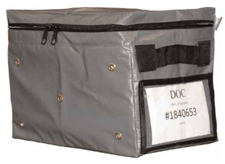
Item: PCSBX103423IMP 10"W x 16 1/4"D x 11"H Available in Gray