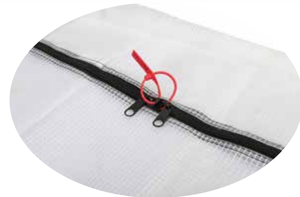
Available with a zippered closure!